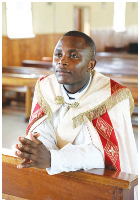
A young man in Cameroon, training to become a priest