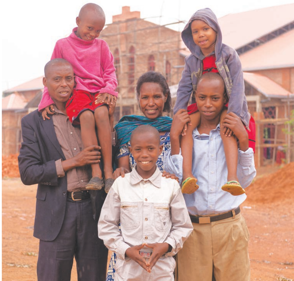
Many families strive to live out their faith in Rwanda