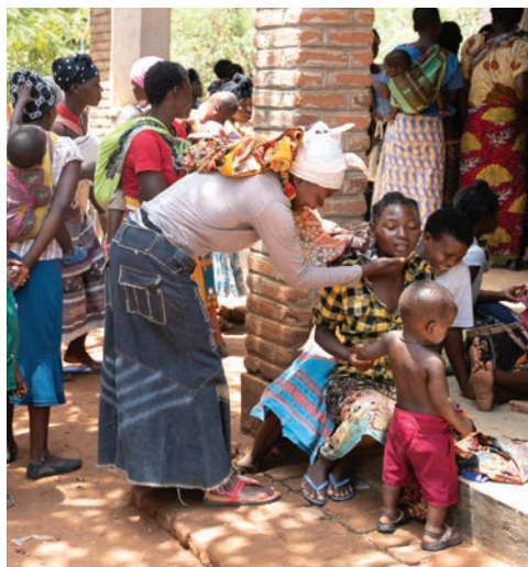
Mothers and babies waiting to be seen at the Lisanjala Health Clinic, Malawi

because we love God and we love his people. I believe in the goodness of God and we serve as Jesus did. But sometimes, the darkness seems very dark.