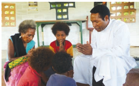
A priest praying with his community, Papua New Guinea

Here I am, Lord, send me to share your love with all people. May I be empowered and carried by you to be courageous and enthusiastic in bearing faithful witness to the merciful Father, to the love of his Son, Jesus Christ, and to the divine life in the Holy Spirit, one God forever and ever. Amen