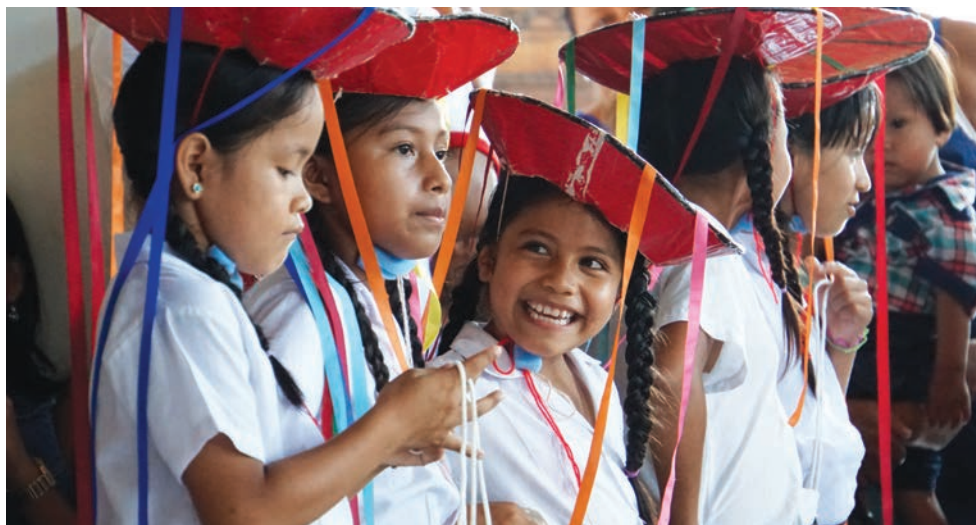
Faith formation for children, Peru

As October comes to a close, we share in God's love and are motivated to make the world a better place. Prayer is the heart of mission. We have included the references to the original texts that have inspired these reflections. We hope you are encouraged to pray for, and take part in, the mission of Jesus to share God's love throughout the world.