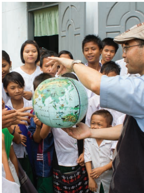
Children learning about our global Church, Myanmar