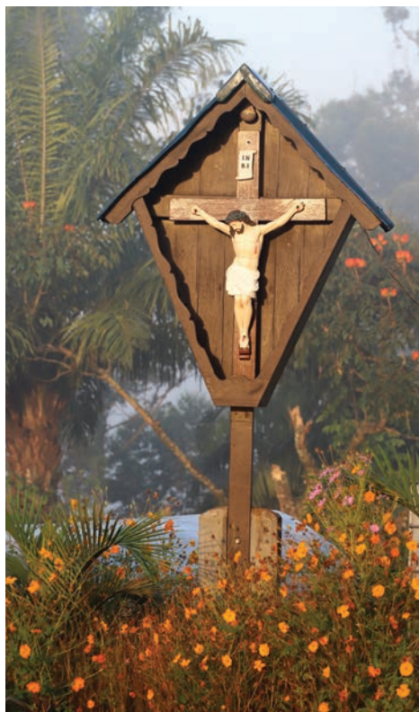
MHM Formation House, Cameroon